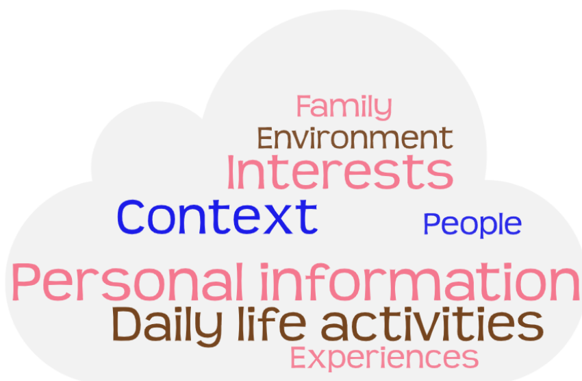
Figure 2. Word Cloud showing categories found in DBA.