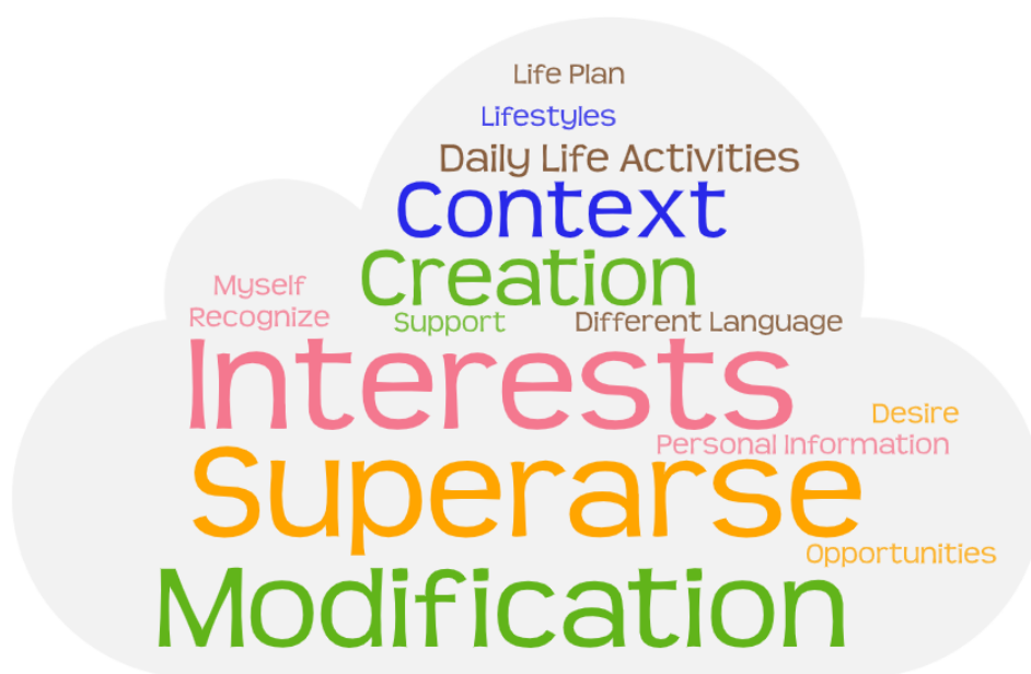
Figure 1. Word Cloud showing categories found in a semi-structured interview.

utilizar una presentación personal y hablar de sus familias” (Interview, September 3rd); which simultaneously displays students’ role in regard to their peers and the teacher by means of these strategies. The last category was (5) motivation, which included the words superarse (which was kept in Spanish to preserve its meaning, referring to the idea of improving oneself), desire, and opportunities, both concerning to a better life quality through access to education and jobs; emerging from the determinant elements that motivate students to be part of a CLEI process. In other words, this has to be considered at the time of engaging students in the classes.