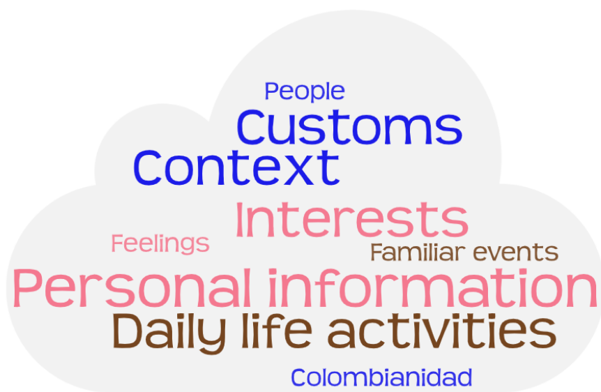
Figure 3. Word Cloud showing categories found in Currículo Sugerido.

category was (3) context, emerging from the keywords daily life activities and familiar events, as these words recall what is part of students' daily life, as a means to build knowledge in the language.